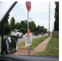
A garden tour got the residents of Bradford Park to take time a smell the beauty during coronavirus.

Bradford Park hosted a yard and garden tour to encourage neighbors to engage and socialize without violating the CDC guidelines for physical distancing. Ten residents hosted a garden walk-through and additional residents hosted a drive by location.